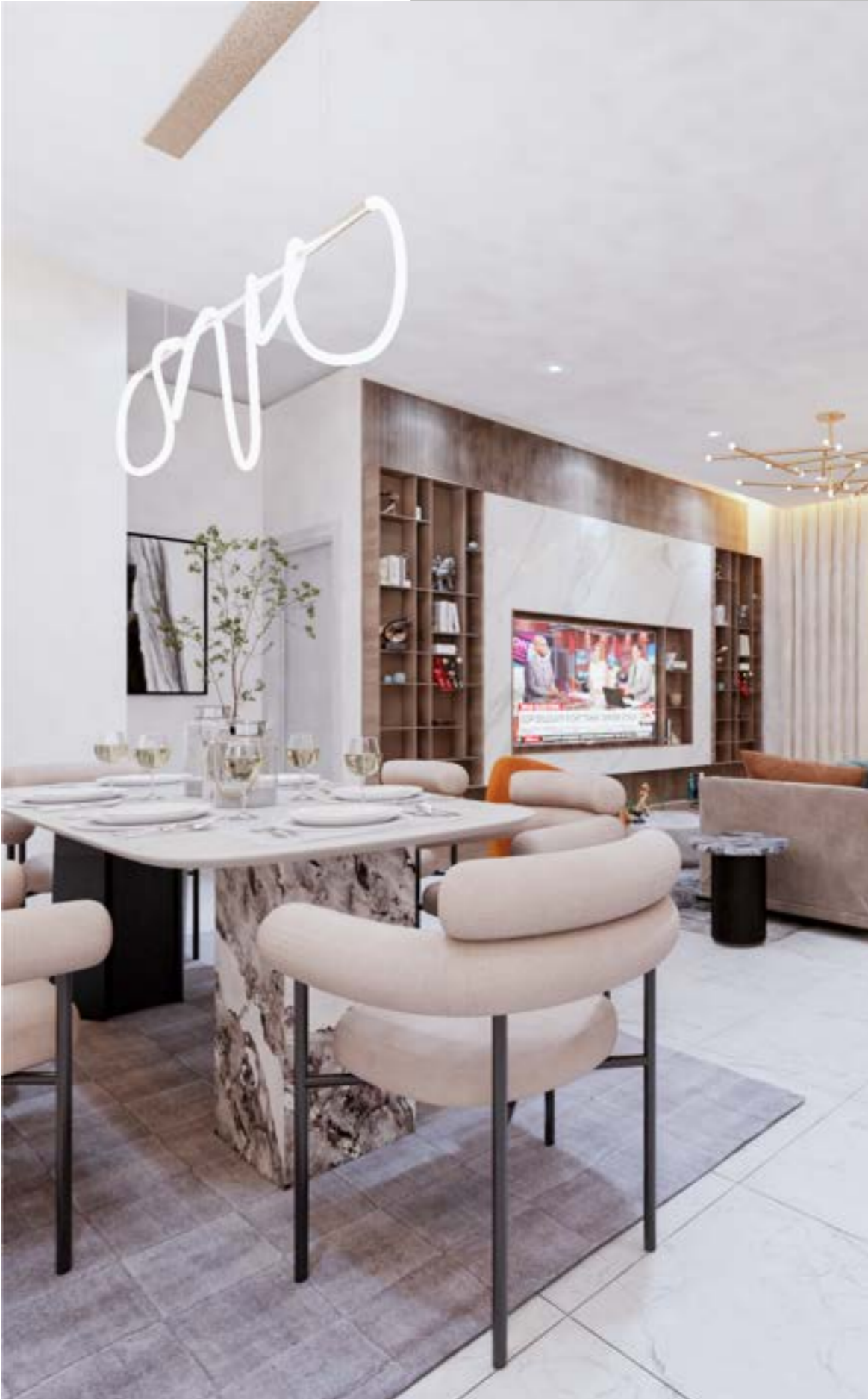
3 bedroom Apartment (Living Area)