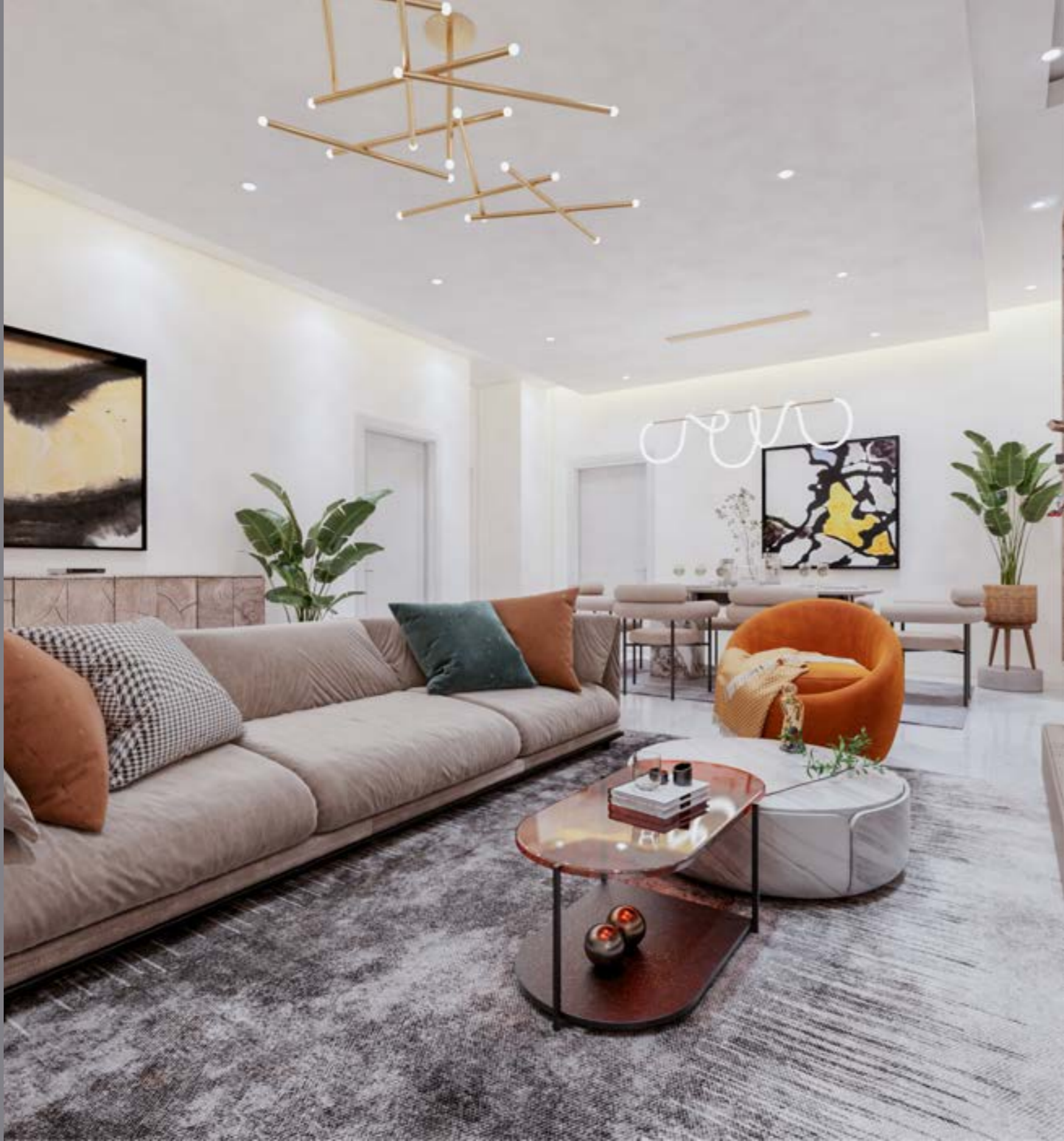
3 bedroom Apartment (Living Area)