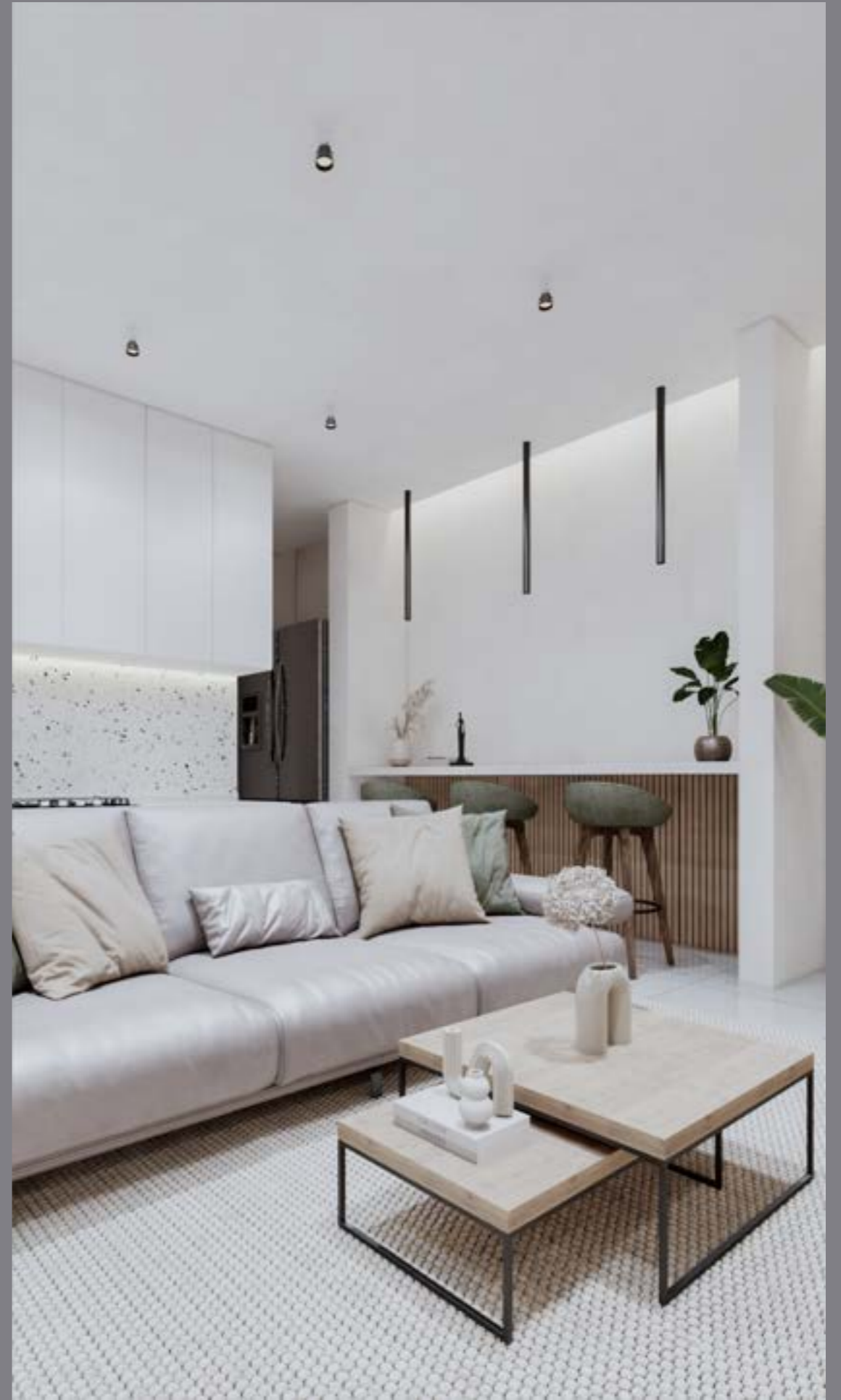
2 bedroom Apartment (Living Area & Cooking Station))