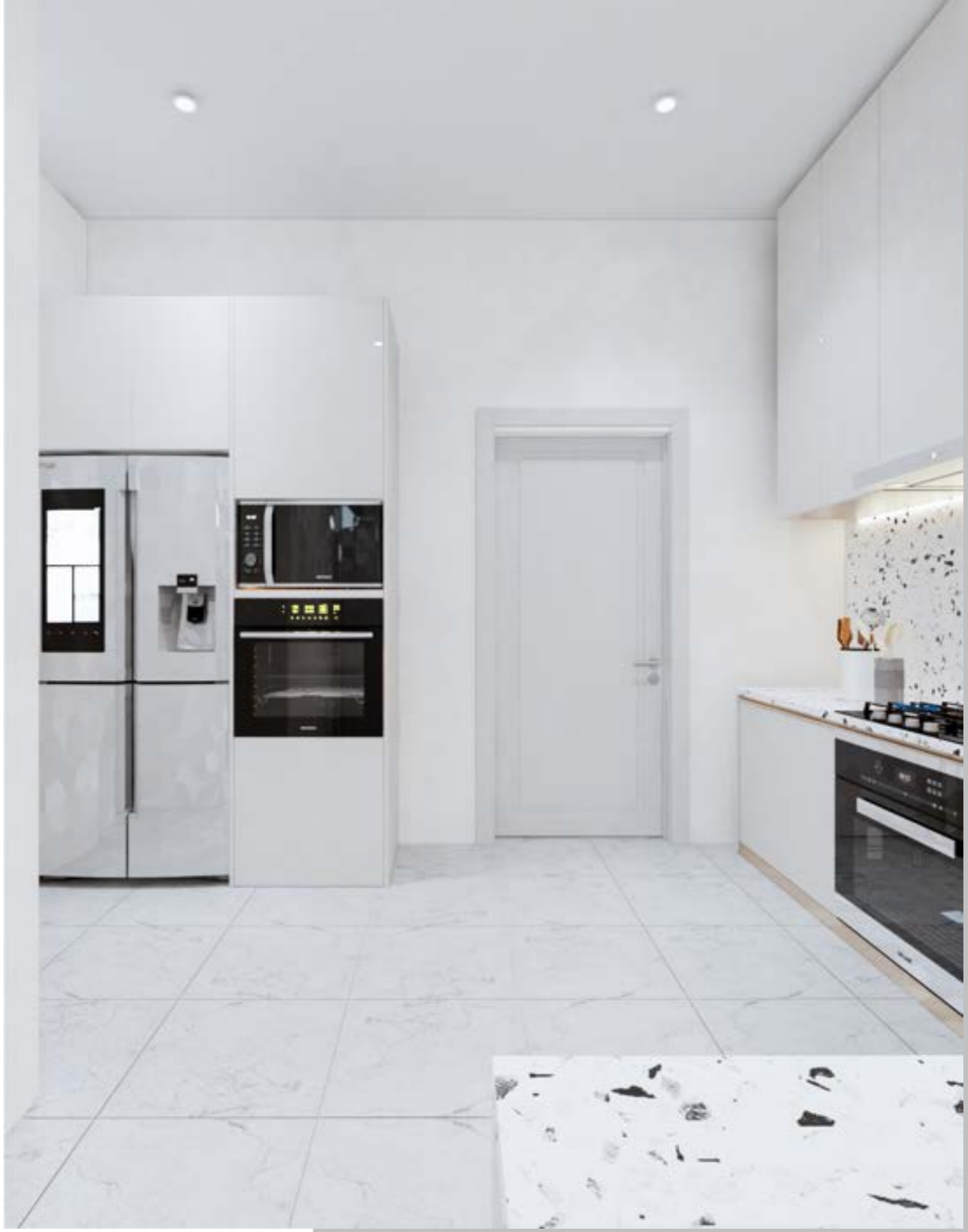
3 bedroom Apartment (Kitchen)