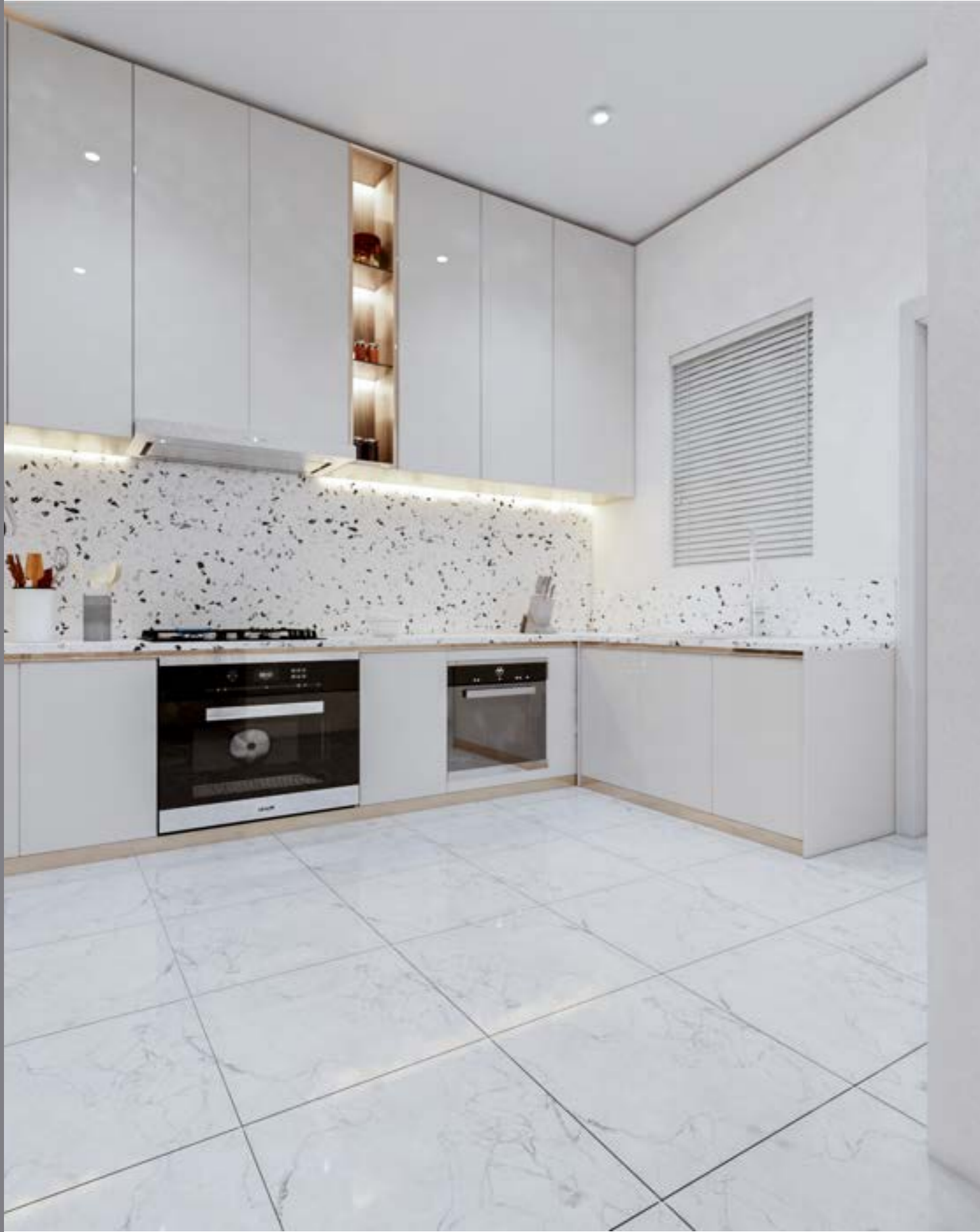
3 bedroom Apartment (Kitchen)