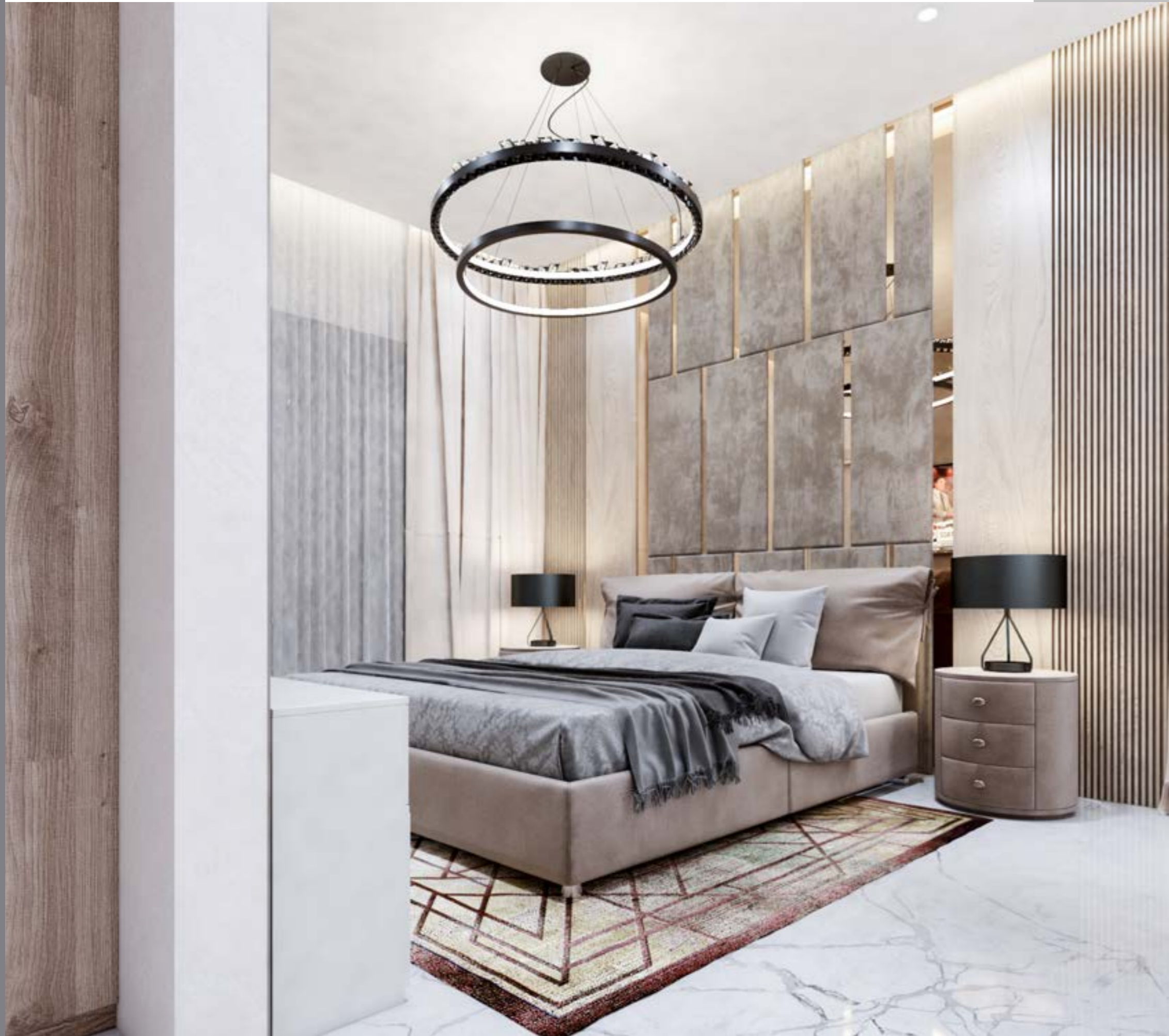
3 bedroom Apartment (Masters bedroom)